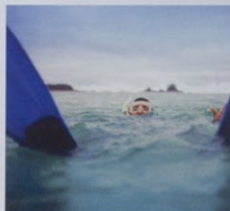
▲ Bird's-eye view of Cornish Cay, Bahamas. Sea-level view of the waters of Abaco.