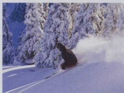
▲ Enjoying the awesome power of powder at Kispiox River, British Columbia.

The value of membership at The Cliffs goes far beyond the Carolinas. The ever-expanding portfolio of The Cliffs' Retreat Collection offers members vacation opportunities, from relaxing getaways to thrilling eco-adventures. And above all, the chance to truly reconnect with nature—some of the most serene, rugged and unspoiled the world has to offer.