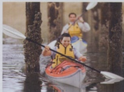
▲ Up the river with a paddle. Kayaking in Hakai Beach, British Columbia.